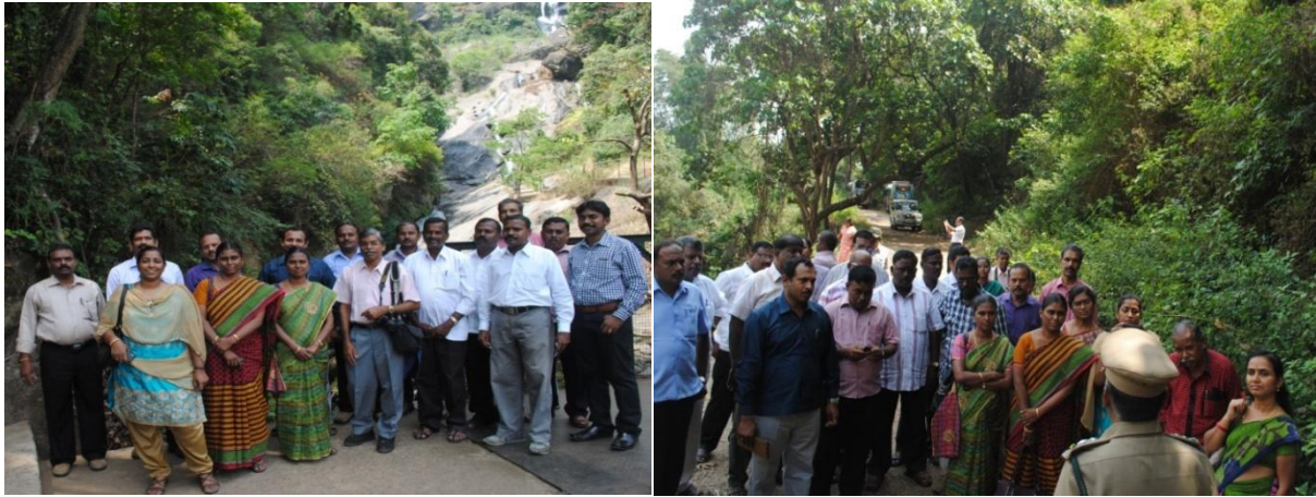
Field visit in Biodiversity Rich Area