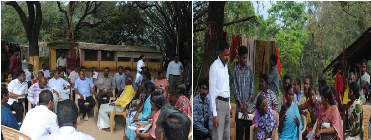
Interaction with Tribal Community at Singampathi village