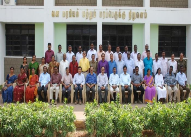
Group Photo at IFGTB