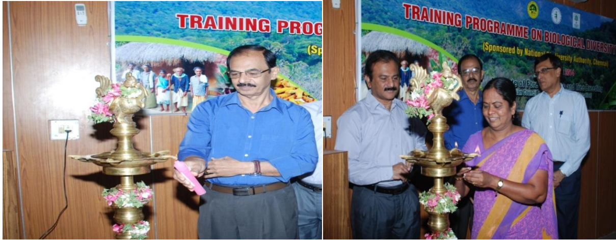
Inauguration - Lighting the lamp by Chief Guest and a Participant