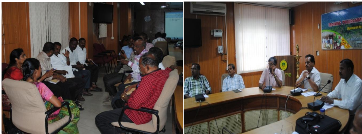
Active Group Discussion