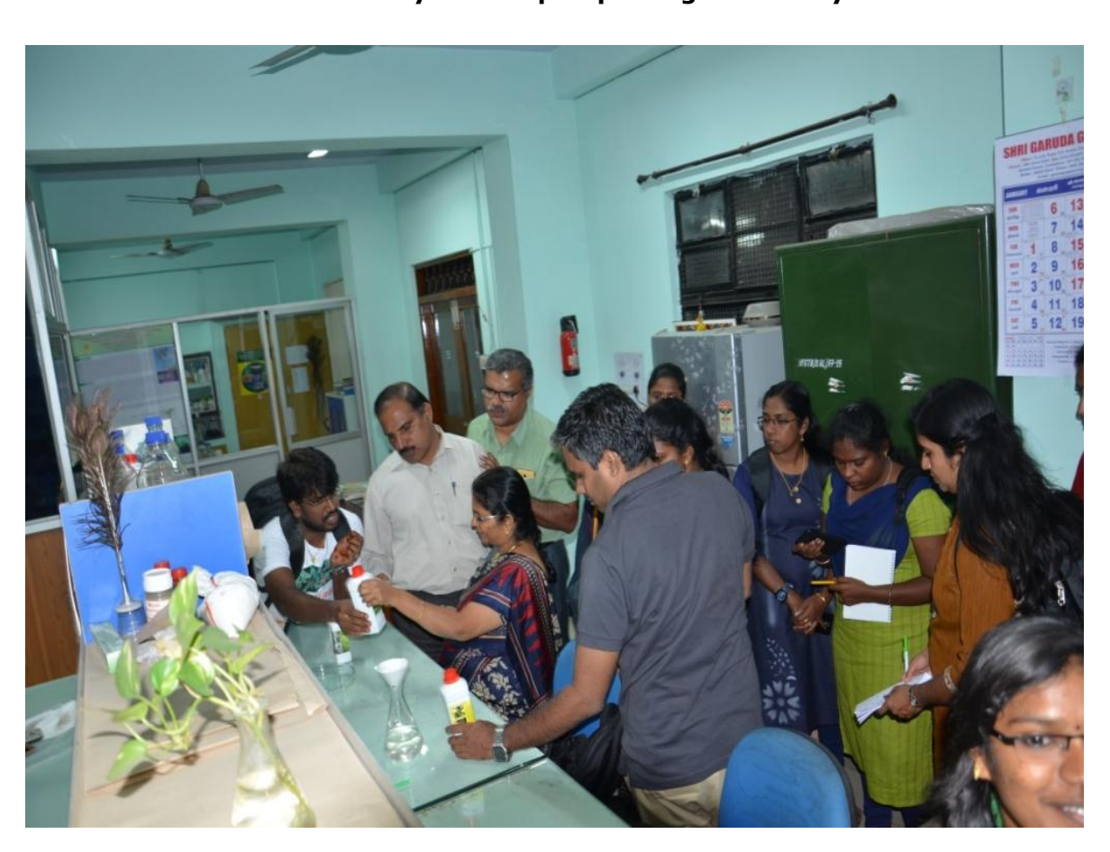
Visit to Biofertizer laboratory