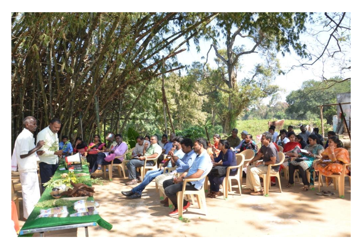
Interaction with tribal medical practitioners at Singapathi, Coimbatore