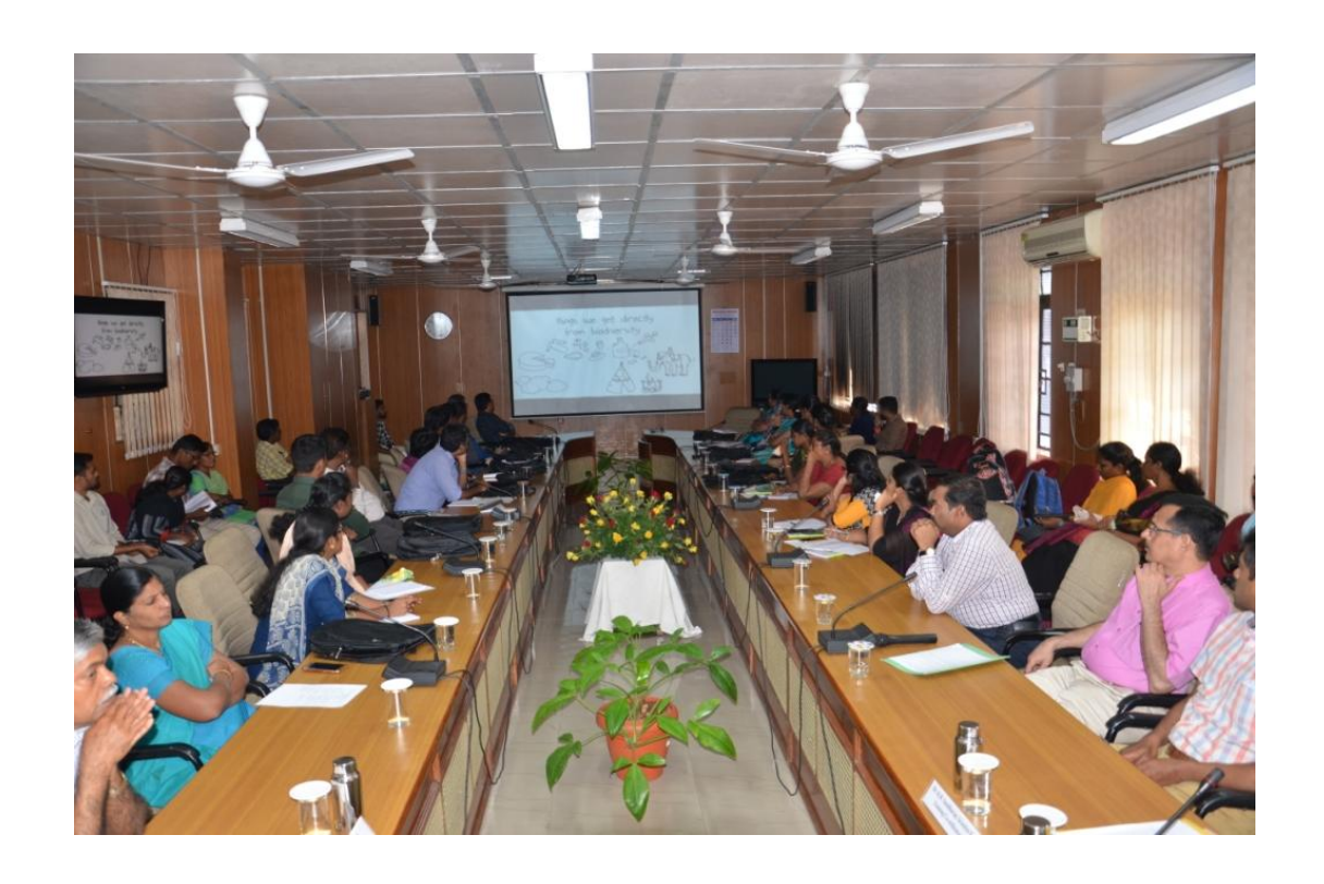
View of participants