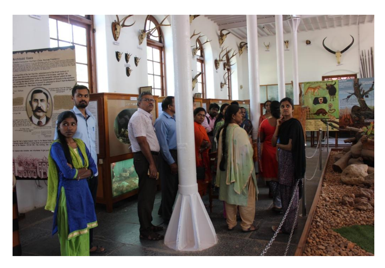
Visit to Gass Forest Museum