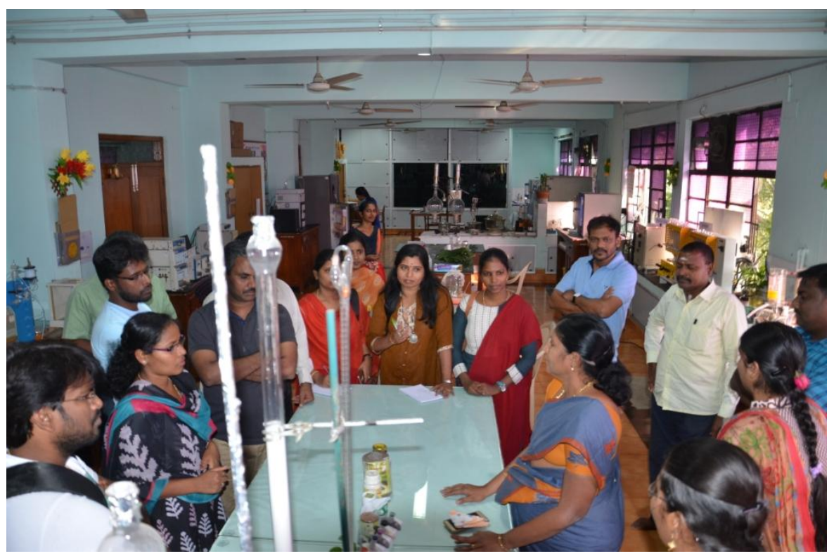
Visit to Chemistry and Bioprospecting laboratory