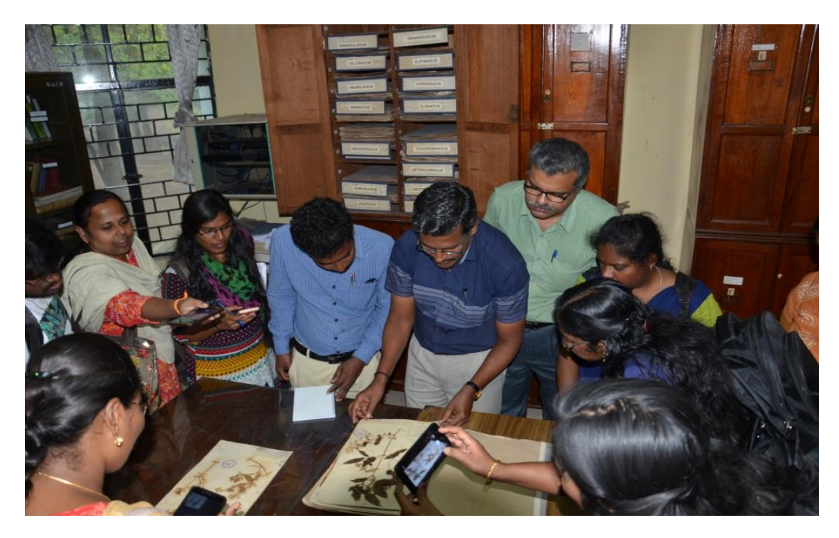
Visit to Fischer Herbarium