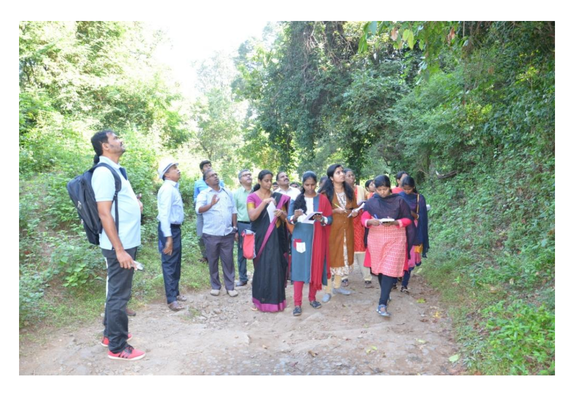
Field visit of participants to foot hills of Siruvani