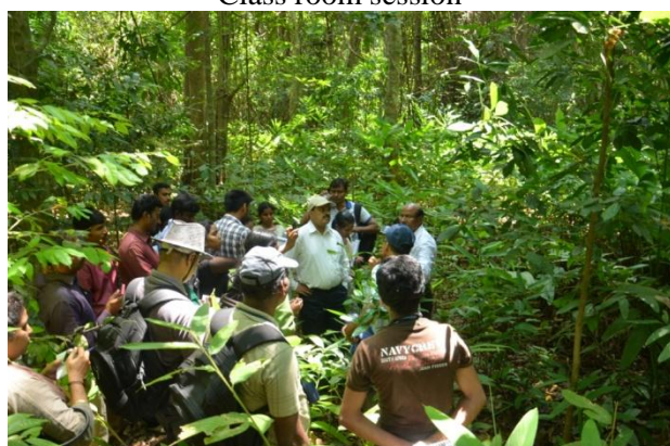
Participants in Silent Valley buffer zone