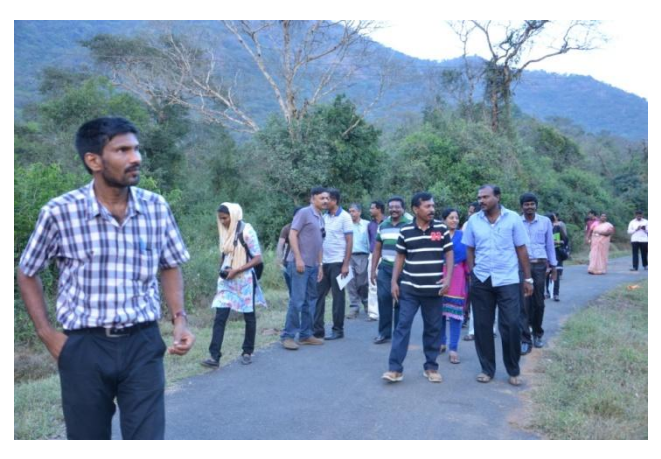
Participants at Anaikatty Forest