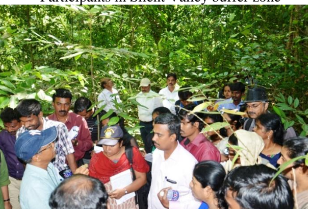
Participants in Silent Valley buffer zone