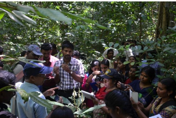
Participants in Silent Valley buffer zone