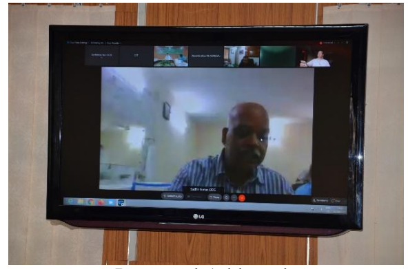
Inaugural Address by DDG (Extension), ICFRE