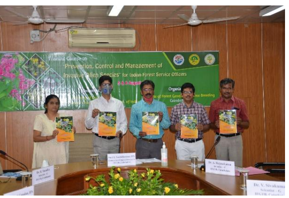
Release of Training Manual

After the inaugural program, on 5<sup>th</sup> August 2021, Dr A. Rajasekaran, Scientist, IFGTB delivered a lecture on Invasive alien plants, risk assessment and their prevention. He discussed about important pathways of introduction, stages invasion, common characteristics of invasive alien species, various theories proposed for invasion success and listed some of the common invasive alien plant species found in India. He also briefed about the positive and negative impacts of invasive alien plant species, existing legislation related to prevention and management of invasive species. The need for weed risk assessment and various preventive measures are also discussed.