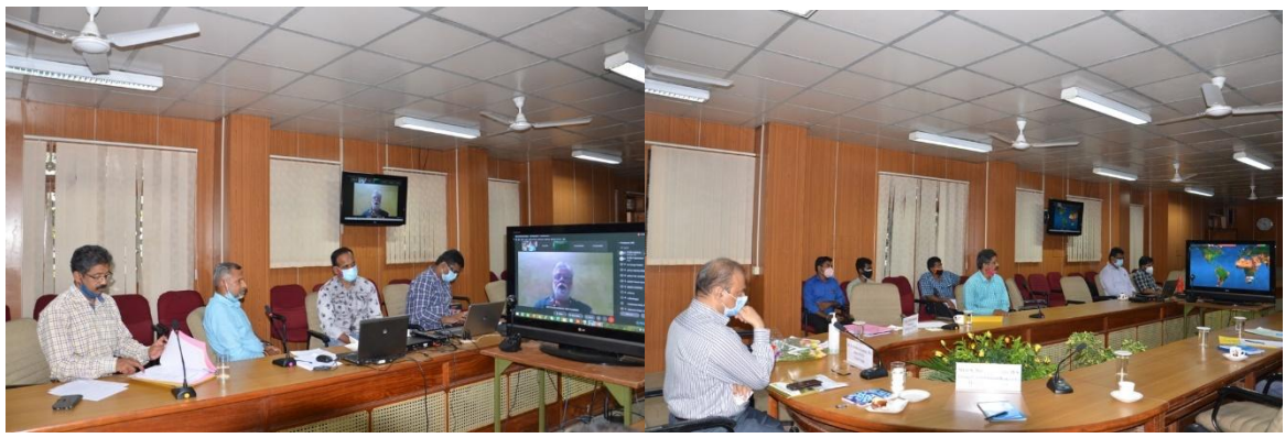
Online interaction during the lecture