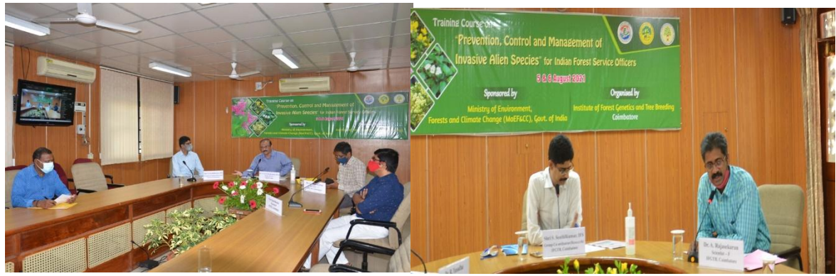
A view of Panel discussion