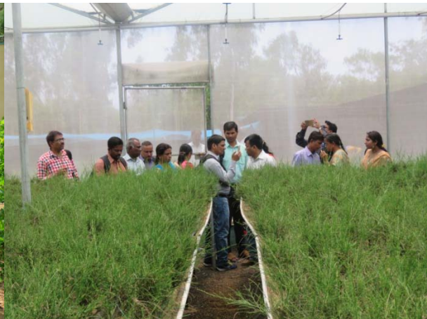
Demo in FGR Nursery and Vegetative Propagation Complex