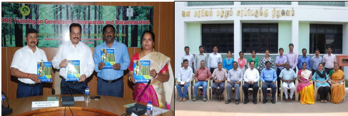
Inauguration of HRD Training on Germplasm Conservation and Documentation