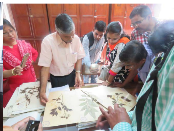
Visit to Herbarium