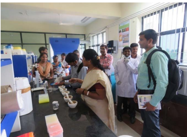
Demo in Characterization Lab