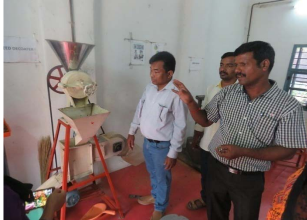
Demo in Seed processing