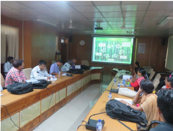
Class Room session