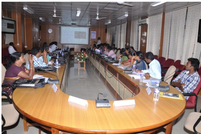
A lecture session during the training