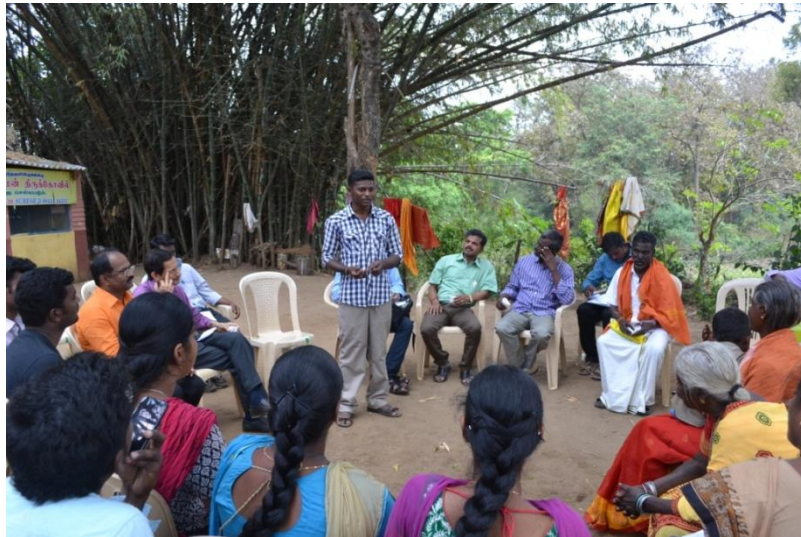
Participants interacting with Irular Tribes of Singapathy, on Traditional Knowledge