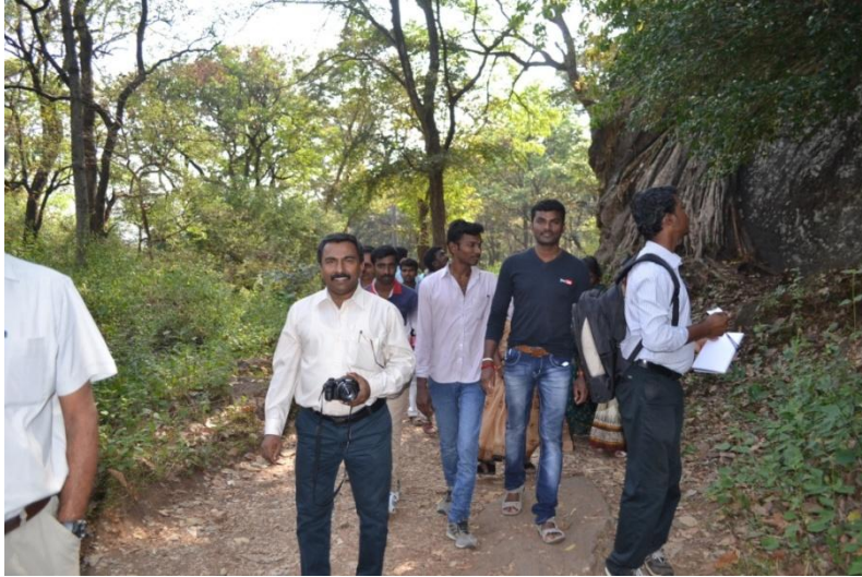
Field visit of participants to Siruvani foot hill