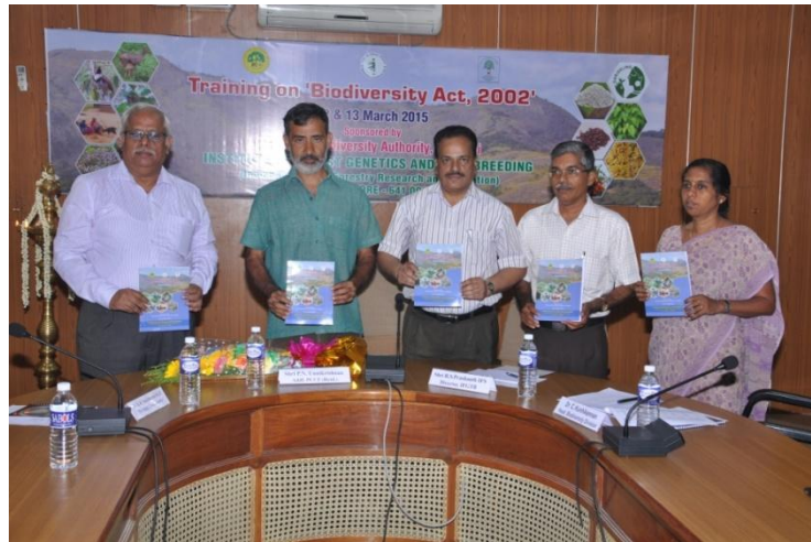
Release of training manual