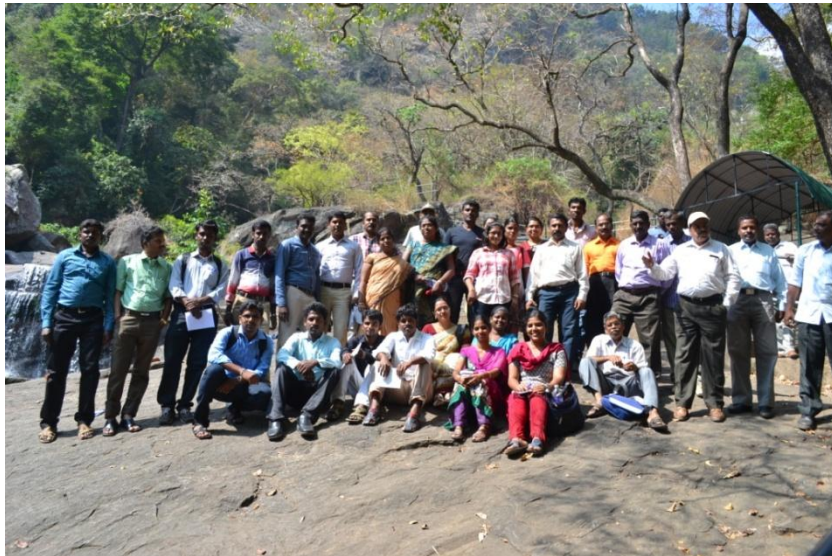
Field visit of participants to Siruvani foot hill