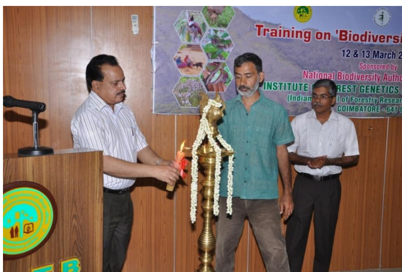
Inauguration of the training programme